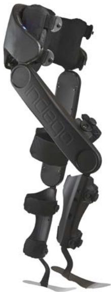
Indego