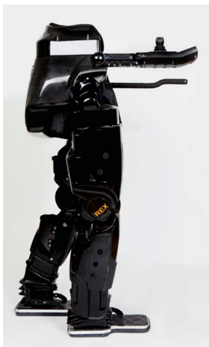
REX Image: REX Bionics plc

Powered exoskeleton training programs were typically conducted three times per week for 60 – 120 minutes per session over a duration of 1 – 24 weeks. Ten of the studies utilised training programs conducted exclusively on flat indoor surfaces, while four incorporated more complex forms of training including walking outdoors, navigating obstacles, climbing stairs and performing activities of daily living. The analysis showed that following the training program 76% of individuals were able to walk using the exoskeleton with no therapist assistance.