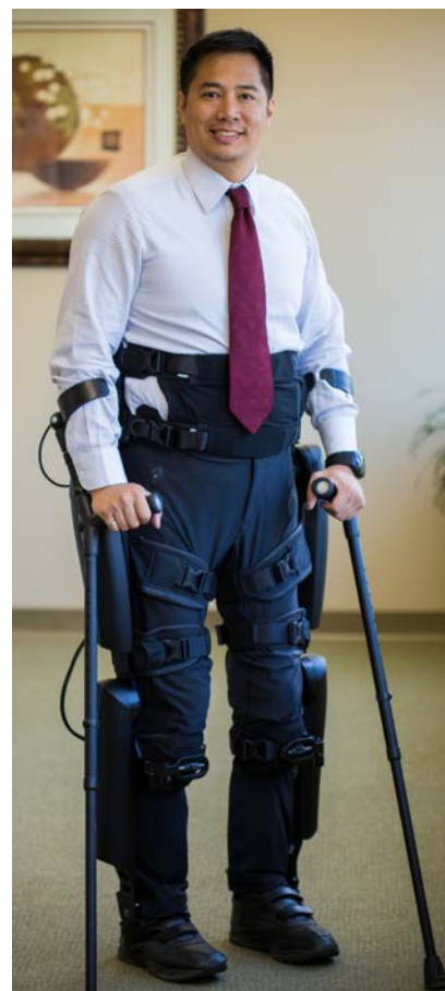
ReWalk Personal 6.0

Powered exoskeletons are designed for individuals with lower limb paralysis or weakness to provide mobility and other health benefits. Lower limb paralysis or weakness can be due to disease or injury including spinal cord injury, stroke, multiple sclerosis or cerebral palsy. The ReWalk, Ekso, REX, Indego and HAL exoskeletons are designed to be used by individuals diagnosed with paralysis. In comparison the Keeogo exoskeleton requires a base level of mobility and is therefore targeted towards patients who can walk and is not intended for individuals with spinal cord injuries causing paralysis. The use of the various exoskeletons may be limited by personal factors such as the users' level and severity of spinal cord injury, fit within the device and upper body strength. Personal factors affecting the use of ReWalk, REX, Ekso, Indego, HAL and Keeogo exoskeletons are summarised in Table 2.