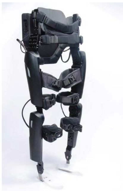
ReWalk Personal 6.0